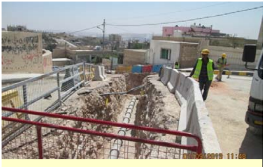
High standards of health and safety measures

The four (4) contracts providing the construction for the Wastewater Network Project are as follows: